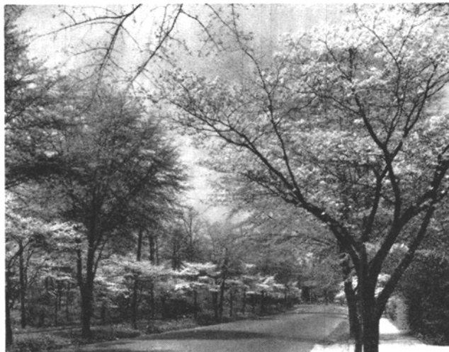
Dogwood trees in full bloom along Atlanta residential avenue